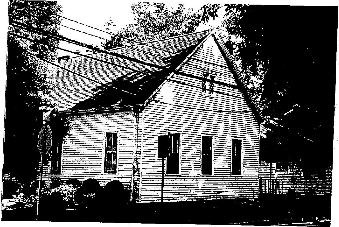
Attachment: Trinity Church (Trinity Church Application)